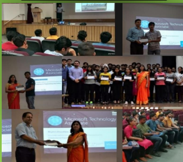
New Initiatives – Summer School