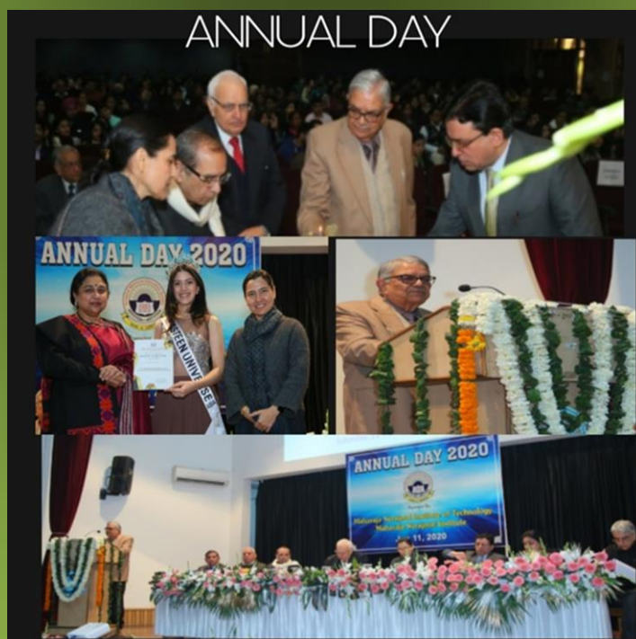
Annual Day 2020