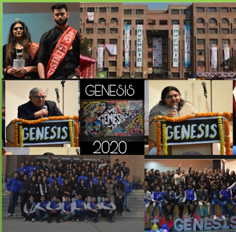
Annual Cultural Fest - Genesis 2020