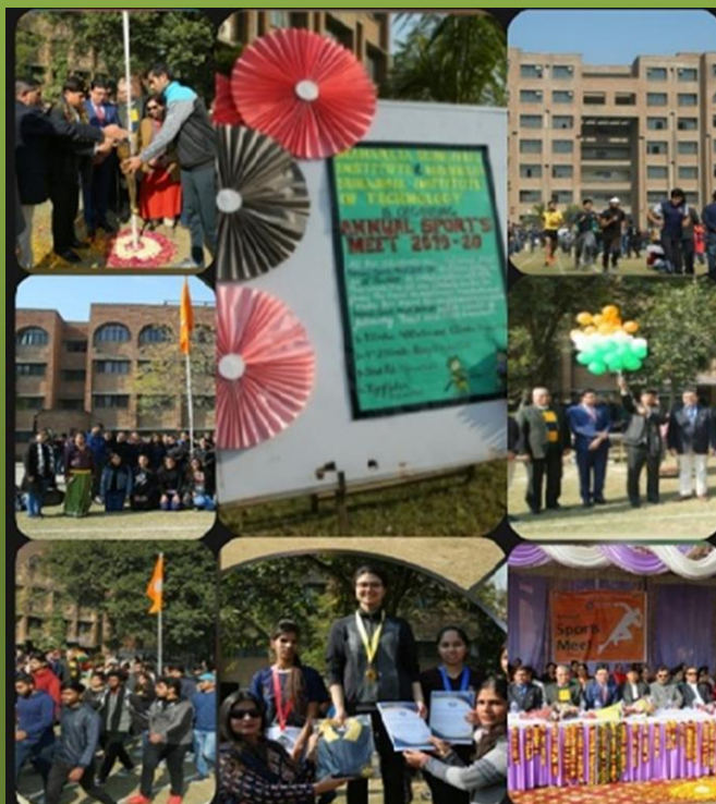
Annual Sports Meet